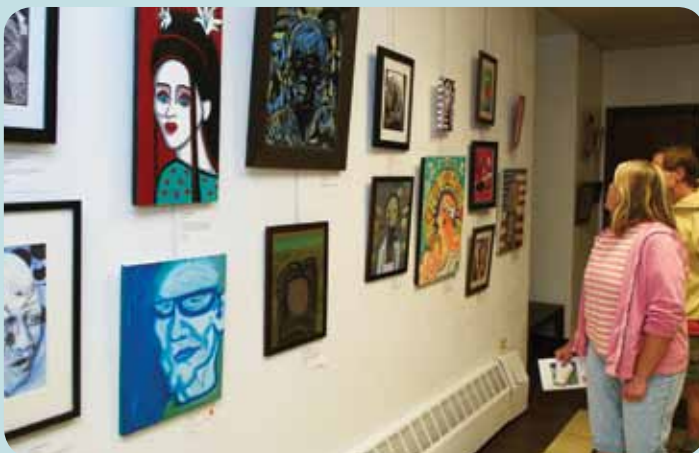
A wall of portraits demonstrates the many talents of Artability artists