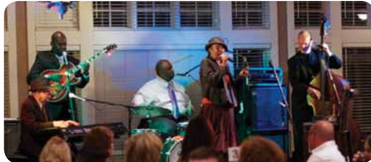
Charmaine Neville and Band