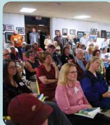
Crowds at the awards ceremony