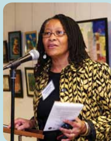
Commissioner Toni Carter